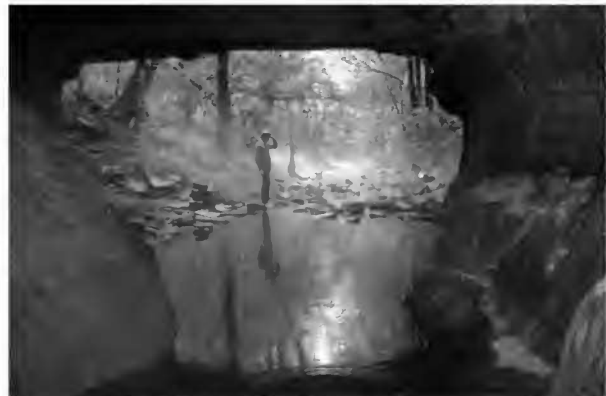
Exterior and interior views of the entrance to Surgener Cave in Lee County, one of Virginia's most biologically significant caves.